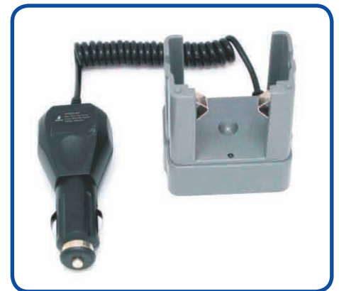
Single charging device KS-5010-M

charging places: 35 primary voltage: AC 230 V / 110 V, 50 Hz power requirement: 140 W output voltage: DC 5,2 V charging current: < 600 mA charging time: < 7 h dimensions: 865mm x 560mm x 110mm (w x h x d) weight: 16 kg