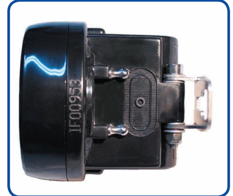
The contacts underneath the lamp are made from nickel-plated brass.