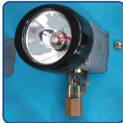
Lamp fixed with a padlock

charging places: 53 primary voltage: AC 230 V / 110 V, 50 Hz power requirement: 250 W output voltage: DC 5,2 V charging current: < 600 mA charging time: < 7 h dimensions: 1105mm x 835mm x 155mm (W x H x D) weight: 35 kg