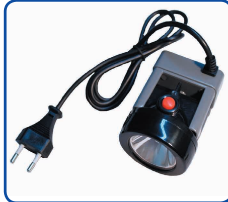
Lamp in single charging device