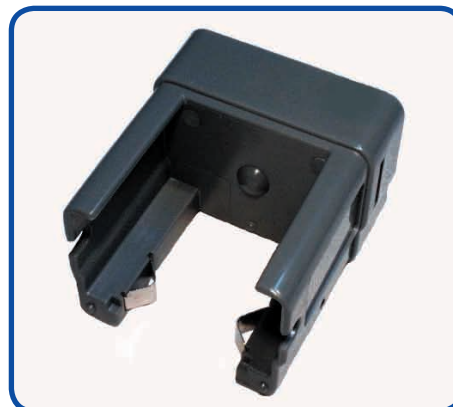
Single charging device KS-5330, resp. KS-2036-M