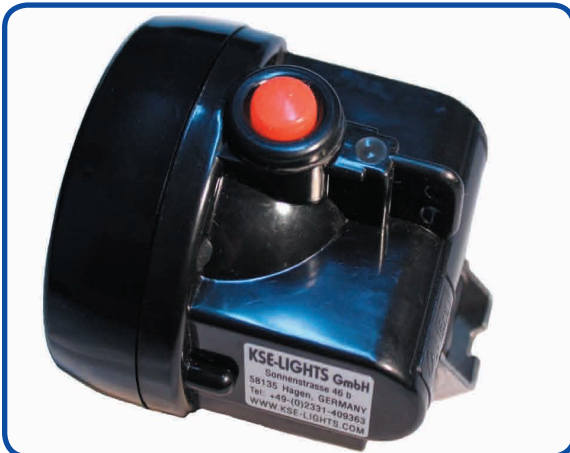
The upper charging contact is sealed