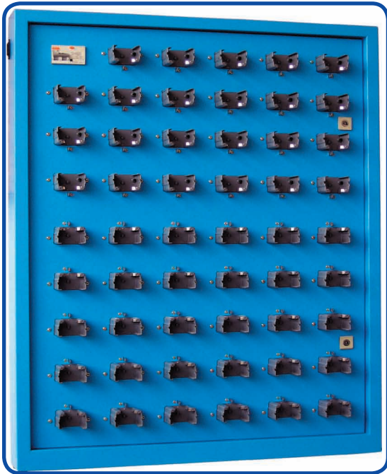
Charging board for 53 lamps