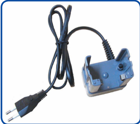
90 - 260 V 230 V single charging device